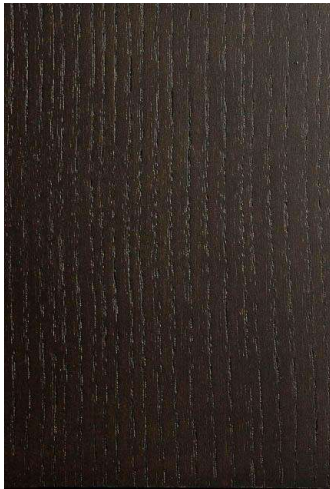
VENEERED WOOD MOKA