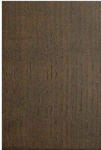
VENEERED WOOD BROWN