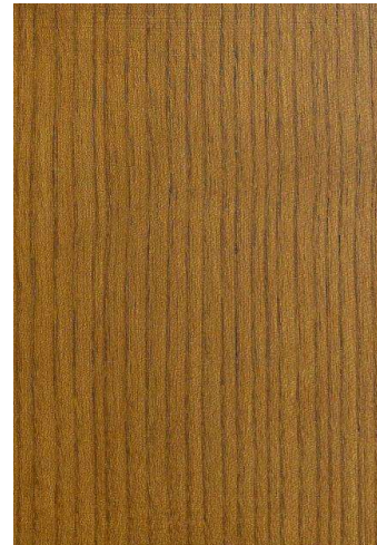
VENEERED WOOD TOBACCO