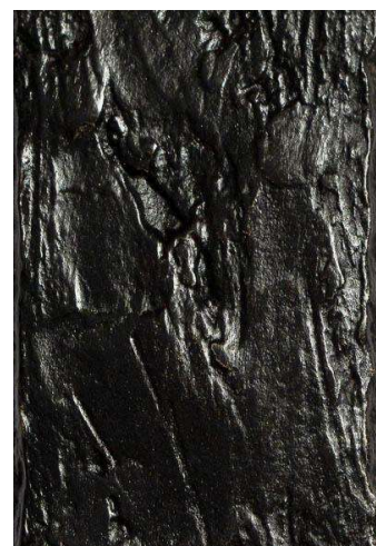
CAST BRONZE BLACK PATINA