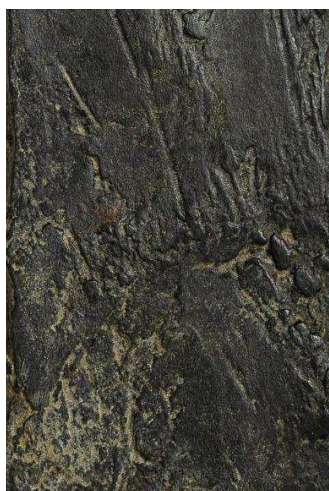
CAST BRONZE GREY PATINA