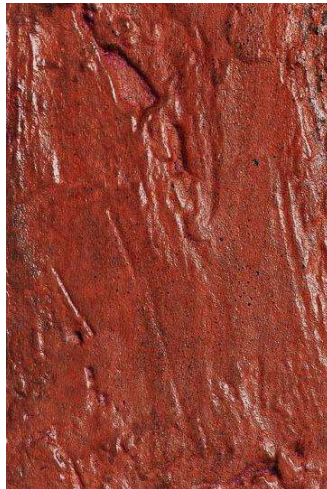
CAST BRONZE RED PATINA