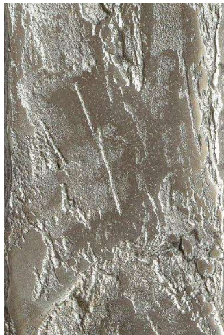
CAST ALUMINIUM BRUSHED