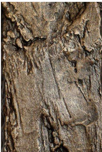
CAST BRONZE MEDIUM BROWN