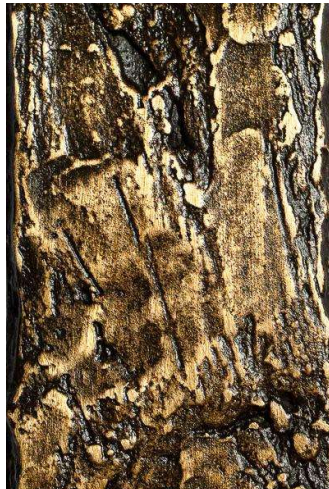
CAST BRONZE BRUSHED BROWN