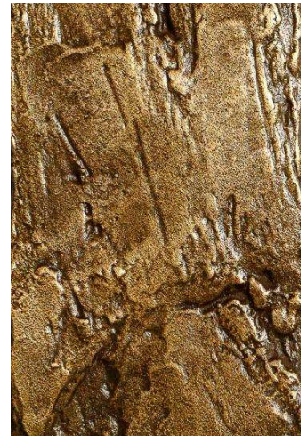
CAST BRONZE GOLDEN