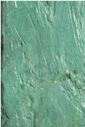
CAST BRONZE GREEN PATINA