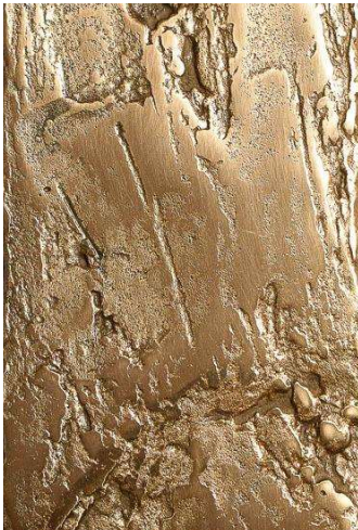
CAST BRONZE POLISHED