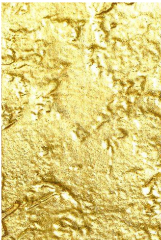
CAST BRONZE GOLD LEAF