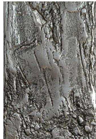
CAST ALUMINIUM POLISHED